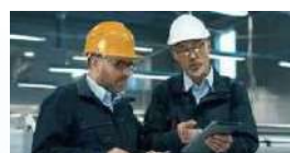
Supply Chain Consultants