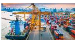
Cargo, Logistics & Supply Chain