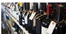
Liquor & Wine