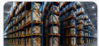
Storage & Racking Solutions