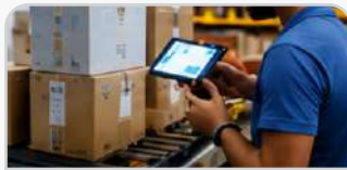
AIDC, RFID & IoT