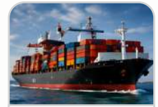
Ports, Railways & Terminals