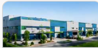
Warehouse Developers & Industrial Parks