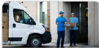
Urban and Last-Mile Logistics