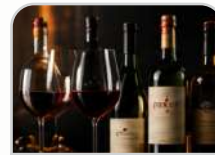
Liquor & Wine