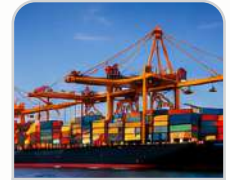
Cargo, Logistics & Supply Chain