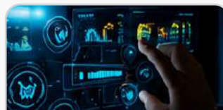
Data Analytics and Artificial Intelligence (AI)