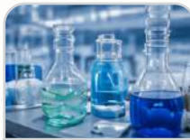
Chemicals & Petrochemicals