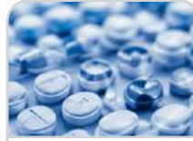
Pharma & Healthcare