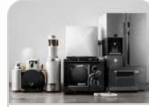
Electronics & Consumer Durables