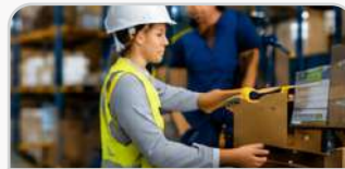
Inventory Optimization Solutions