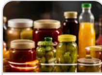
Food/Beverages & FMCG