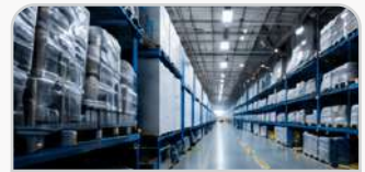
Cold Chain & Temperature -Controlled Storage