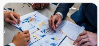
Consulting and Services