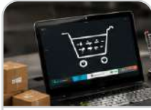
E-Commerce & Retail