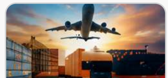
Reverse Logistics and Recycling Solutions