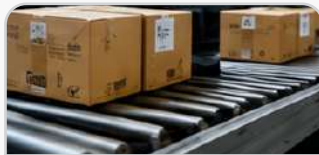
Packaging & Labeling for Logistics