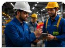
3PL/Logistics Service Providers