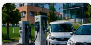
Hybrid and Alternative Fuel Vehicles