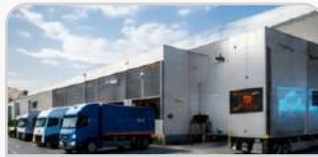
Logistics & Supply Chain