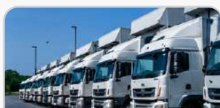
Commercial Vehicles & Transport