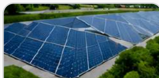
Energy Efficiency & Sustainability