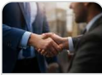
Supply Chain Consultants