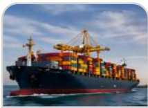
Shipping & transportation