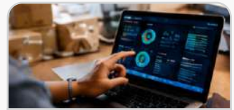
Warehouse Management Software (WMS)