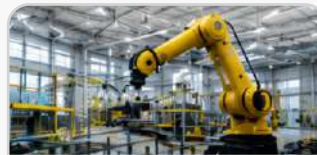
Logistics Automation & Robotics