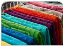
Textiles & Apparels