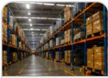
Factory & Warehouse Consultants