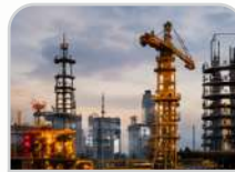
Infrastructure & Construction