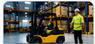
Safety & Security