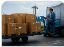
Delivery & Last Mile