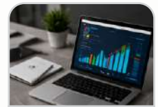
Data Analytics & Tech Solution Providers