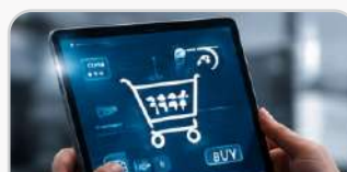
E-commerce & Fulfillment Solutions