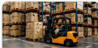
Material Handling Equipment