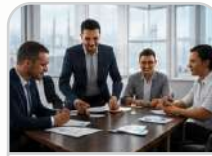
Warehouse owners/ operators