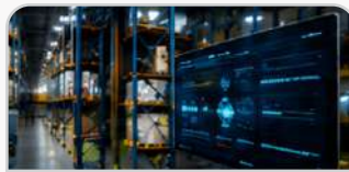
Supply Chain Visibility