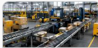
Material Flow Solutions