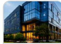
Real Estate Owners/ brokers